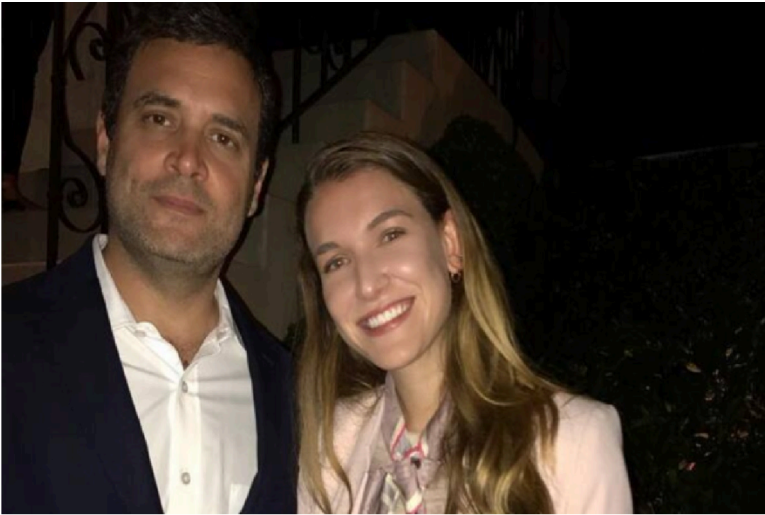
Rahul Gandhi with Spanish actor turned "political powerhouse" Nathalia Ramos

As a secular individual, I am indifferent to Motilal Nehru's double marriage, Jawaharlal Nehru's extramarital romantic and physical relations with British Viceroy Lord Mountbatten's wife Edwina Mountbatten, or Sonia Gandhi's past liaisons with multiple men; these are well-known to everyone. My focus in this article is Rahul Gandhi, who harbors plenty of shocking and dark secrets that the people of India deserve to know.